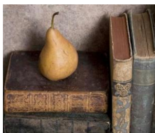
DENVER MEDICAL TIMES, VOLUME 20